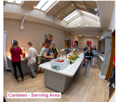
Canteen - Serving Area