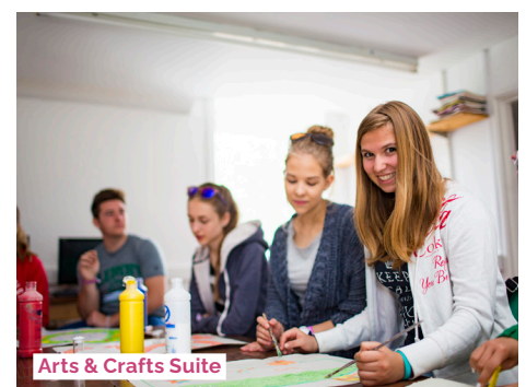
Arts & Crafts Suite